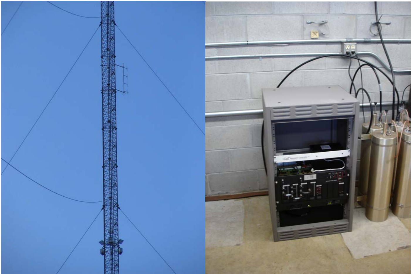
WE9COM Repeater in Suring, WI